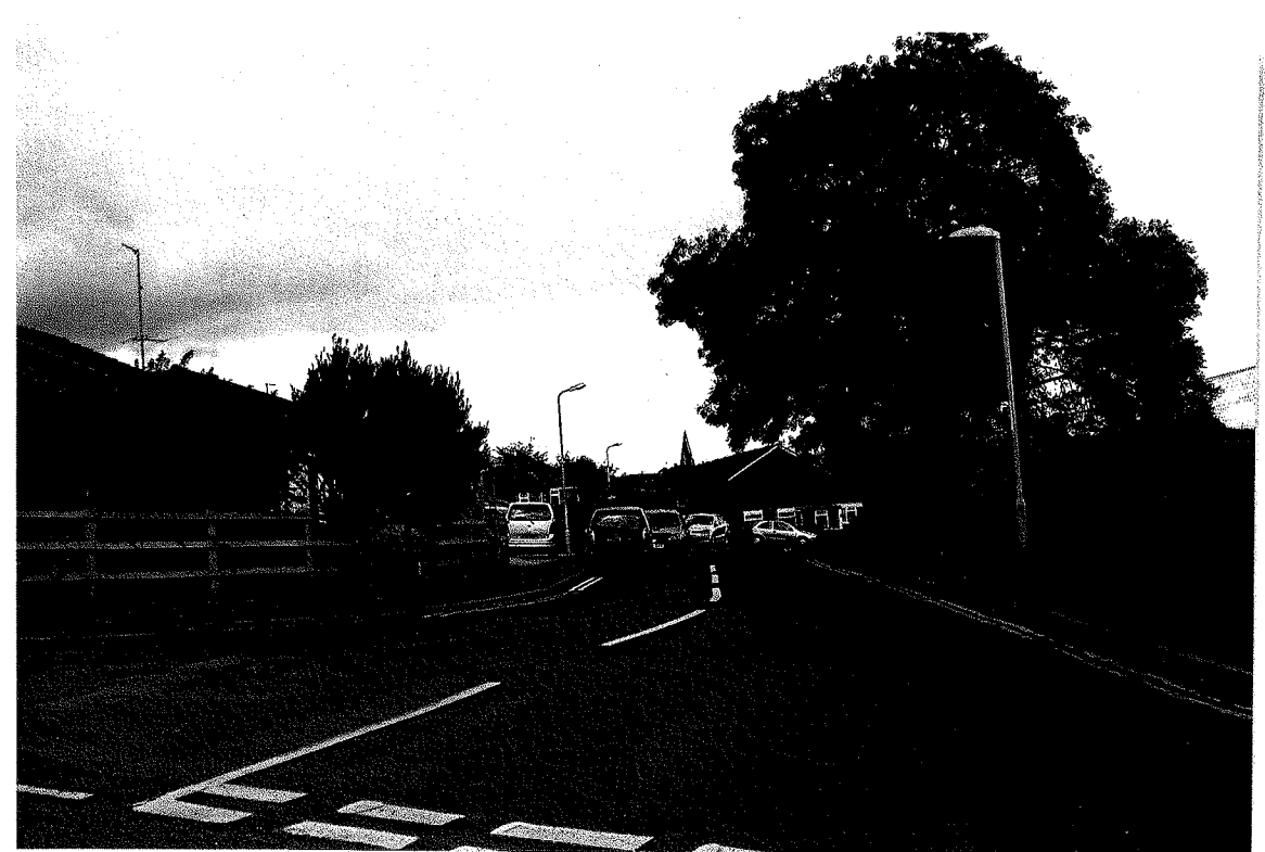
VIEW I FROM SHOE LANE INTO WELLFIELDS DRIVE CONTINOS YELLOW LINES ON RIGHT, THOSE ON LEFT STOPAT REAR OF RESCAR.