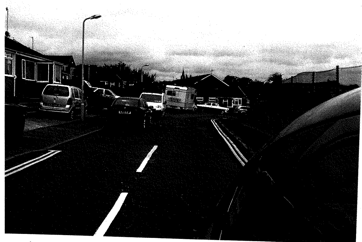
VIEW 3 LOOKING TOWARD BEND SHEWING LACK OF YELLOW LINES ON NEARSINE OF CARRIAGE WAY